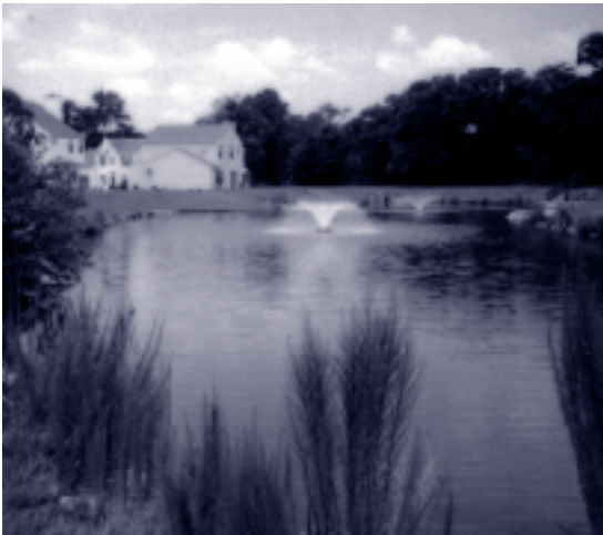
BMPs reduce pollution and flooding by containing stormwater.

Sediment removal is usually the largest single cost of BMP maintenance; therefore, it is best to plan ahead to allow for contractual negotiations, as well as adequate funding.