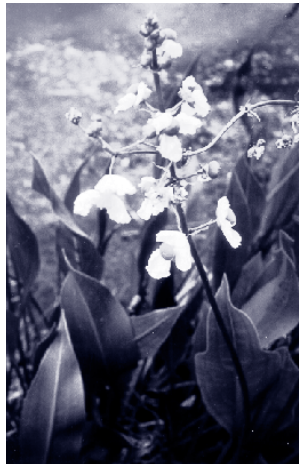
Plants absorb runoff water.

Aquascaping is simply landscaping the shoreline of ponds and lakes with aquatic and wetland plants. Ponds and lakes with a landscape design have fewer problems than those without. Vegetation filters polluted runoff and traps sediments. Aquatic plants pump oxygen into the water and create habitats by providing cover and nurseries for fish and other organisms. More importantly, vegetated shorelines help improve water quality. Vegetated stormwater