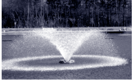
Aerators can be functional and decorative, unlike fountains which are only decorative.

Aeration is a cost-effective method of enhancing water quality and provides an environmentally friendly alternative to chemical use.