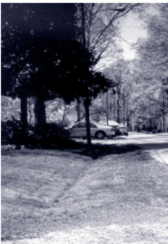
If you have a grassed swale like this in your yard, you have a BMP.

allow more time for pollutant settling and removal. Since there are only two natural lakes in Virginia, it is likely the lake in your neighborhood is actually a stormwater retention pond.