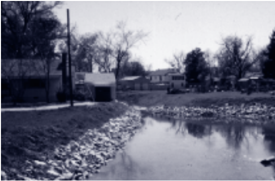
A well-kept retention pond with rip rap.

Detention Basins/Ponds (also known as dry ponds) are man-made basins, which detain water for specified periods of time after a storm. Dry ponds do not contain a permanent pool of water and are normally dry during non-rainfall periods. Water is impounded temporarily to allow much of the sediment carried by the runoff to settle to the bottom. Many of the pollutants, such as nutrients, are attached to sediment particles and are also removed. The impounded water is discharged via an outlet. No standing water should remain if the facility is functioning properly.