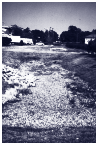
A well-maintained detention or dry pond.

Concentrated input facilities receive stormwater from curb inlets, gutters and pipes.