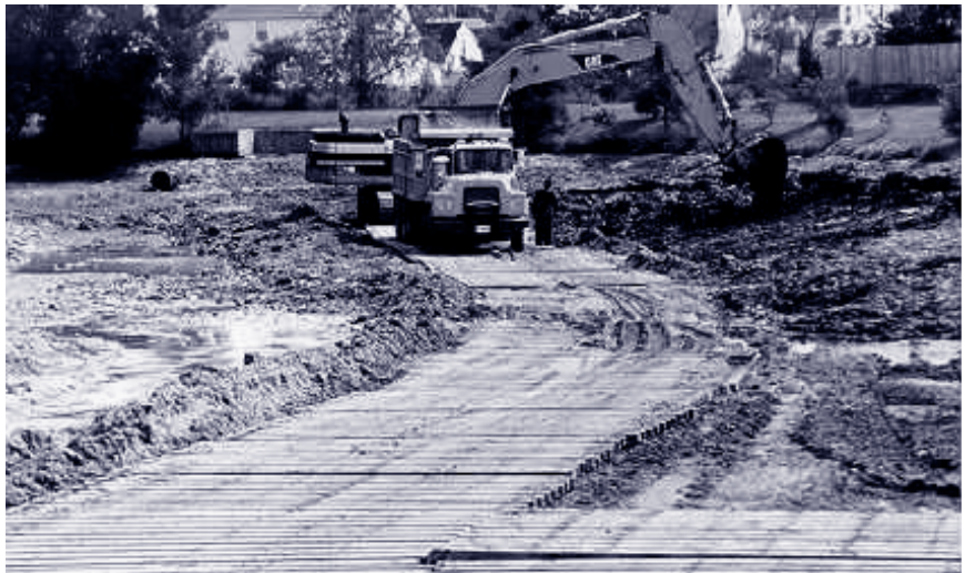
Dredging helps lower nutrient concentrations in water.

Sediment will accumulate in a BMP and will eventually need to be removed, but facilities vary so much that there are no hard and fast rules about when and how. For