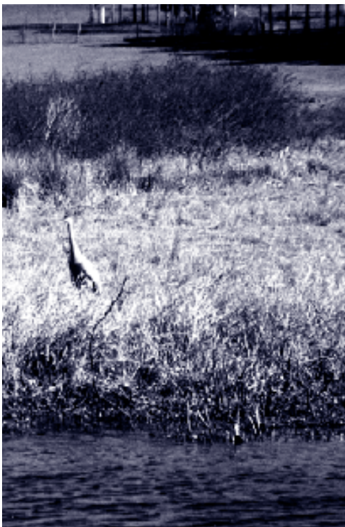
Plants along the edges of BMPs filter pollutants.

The vegetation surrounding infiltration trenches or buffer strips also removes some