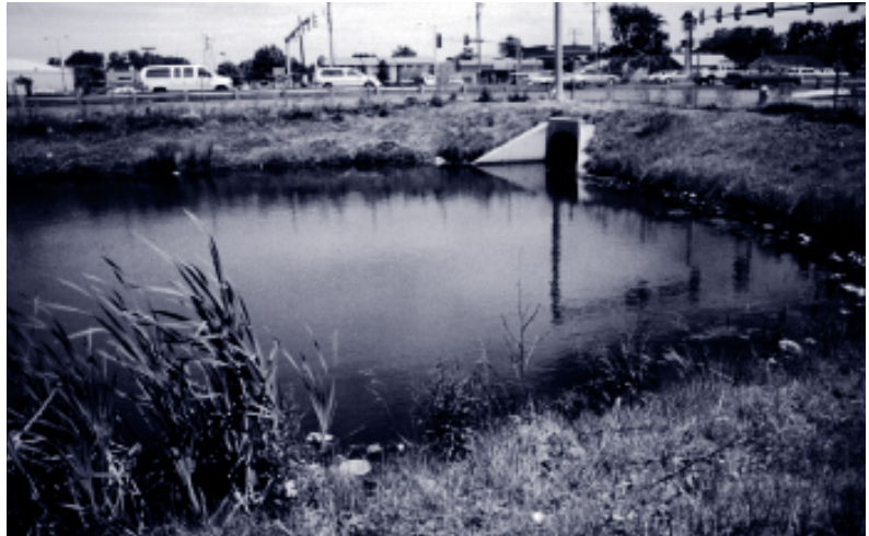
A properly functioning retention pond.

Infiltration facilities tend to clog more frequently than either detention or retention basins. Therefore, it is recommended that these facilities be inspected at least two to four times a year. Most infiltration trenches have a sediment trap or filter to remove some sediment before the stormwater enters the trench. Keeping this sediment filter clean is vital to ensuring the long-term performance of the infiltration trench.