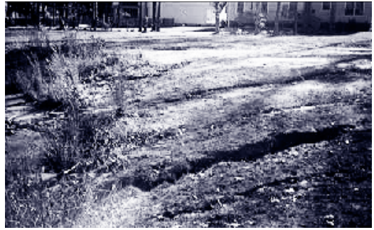
Healthy ground cover prevents erosion.

embankment and can play an important role in the health of the vegetative environment. For ease of maintenance, trees and shrubs should be planted outside maintenance and access areas.