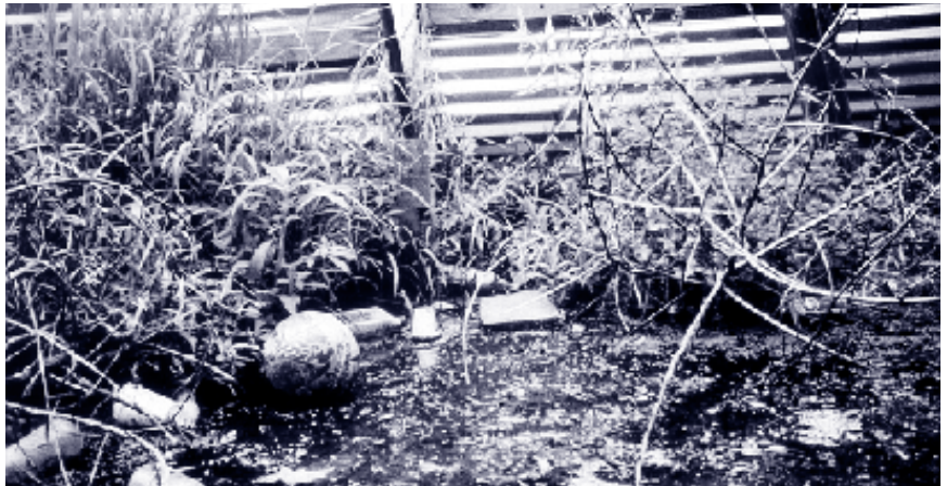
Remove debris to improve BMP function and aesthetics.

Each type of BMP may have mechanical components that need periodic attention to ensure their continued performance. Valves, gates, pumps, fences, locks and access hatches should be maintained at all times. Design and site factors will determine the amount of maintenance that is necessary.